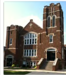
Calvary Baptist, Sheldon, IA