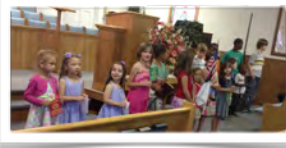
The girls singing in VBS at Meadowview Baptist.