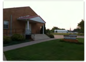
Calvary Baptist, Ottumwa, IA