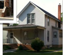
Mission house in Sheldon, IA.