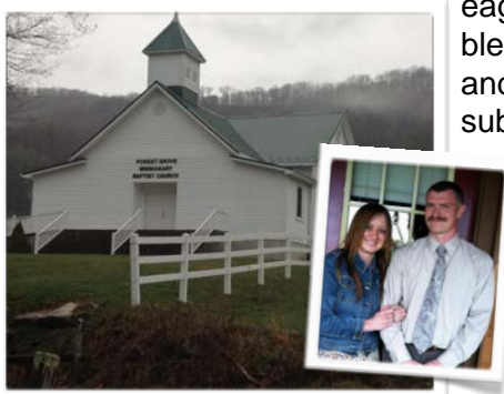
Forest Grove Missionary Baptist, Vilas, NC

In addition to the miles travelled and the meetings attended, I have also been required to continue working forty plus hours a week at BE Aerospace. God has proven His sovereignty to us again and again through this position. The heart of the king "truly" is in the hand of the Lord. He continues to bless the work