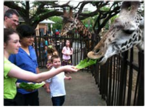
The kids feeding the giraffes.