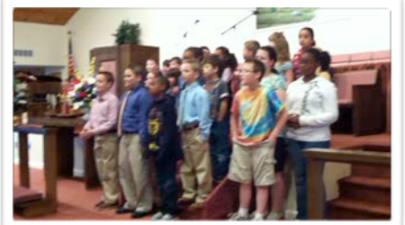
The girls singing with the Junior choir at Boiling Springs Baptist.

I do as my time at BE comes to a close. I have notified my supervisor June 8th will be my last day, and we can hardly wait!